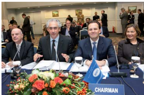
H.E. Mr. Dimitrios DROUTSAS, Minister of Foreign Affairs of the Hellenic Republic, chaired the meeting in his capacity as the Chairman-in-Office of BSEC, along with the Deputy Minister of Foreign Affairs H.E. Mr. Spyros KOUVELIS.

Parallel to the Meeting of the BSEC Council of Ministers of Foreign Affairs, a Business Forum on the promotion of Green Development and Entrepreneurship was organized under the auspices of the Hellenic Ministry of Foreign Affairs. The Forum provided an opportunity for its participants from the wider Black Sea area and beyond to meet, exchange views and explore the possibilities of joint ventures in the sphere of Green Economy.