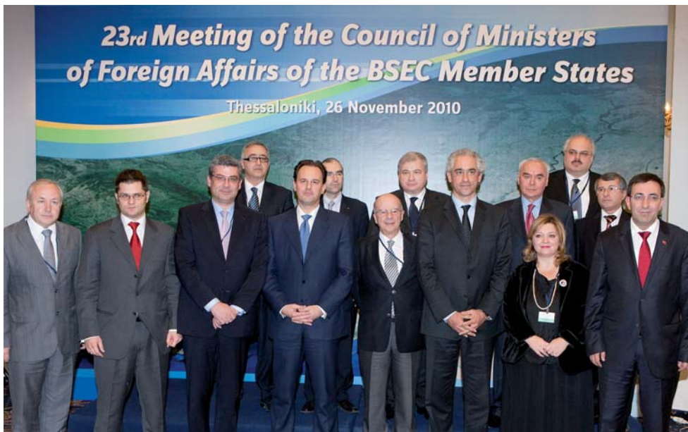
Family photo at the 23rd Meeting of the BSEC Council of Ministers of Foreign Affairs in Thessaloniki.