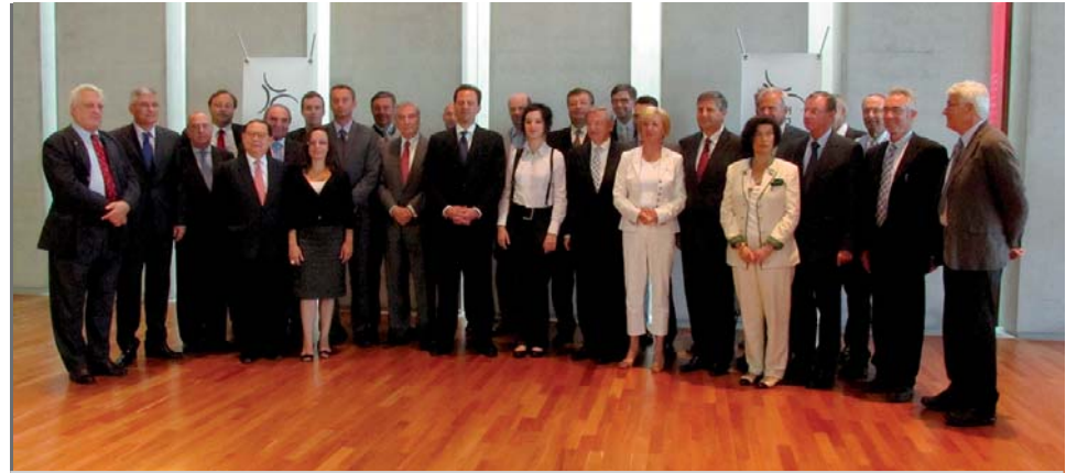
Group photo at the international dialogue forum "Trilogue Salzburg 2010" held on 20-22 August 2010, in Salzburg.

"Trilogue Salzburg" is a prominent intellectual hub that brings together high-ranking politicians, business leaders and cultural ambassadors to discuss cross-cutting global issues, focusing on ways to confront the socio-political challenges being faced by Europe and the international community. This year's roundtable was moderated by the Former Federal Chancellor of Austria, Dr. Wolfgang Schüssel and hosted 33 selected persons, including Ministers of Foreign Affairs, academicians, representatives of international organizations, business people, people from the arts. The BSEC BC was invited to enhance its cooperation with the Austrian Ministry of Foreign Affairs and Bertelsmann Foundation (Bertelsmann Stiftung), the annual organizers of the Trilogue.