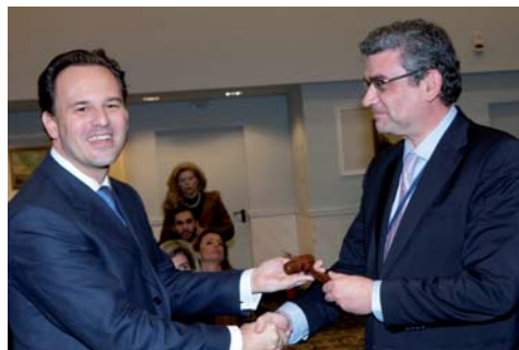
Greece handing over the Chairmanship-in-Office of BSEC to Romania in Thessaloniki, on 26 November 2010.