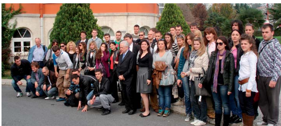
Students of the University of Belgrade during their visit to the BSEC headquarters on 15 November 2010.