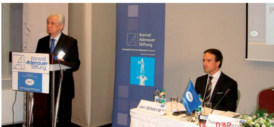
H.E. Ambassador Traian CHEBELEU addressing the participants of the Workshop on Entrepreneurial Education for SMEs in Belgrade.

The Workshop worked out a number of conclusions and recommendations aimed at enhancing the entrepreneurial education in vocational schools and universities in the BSEC Member States.