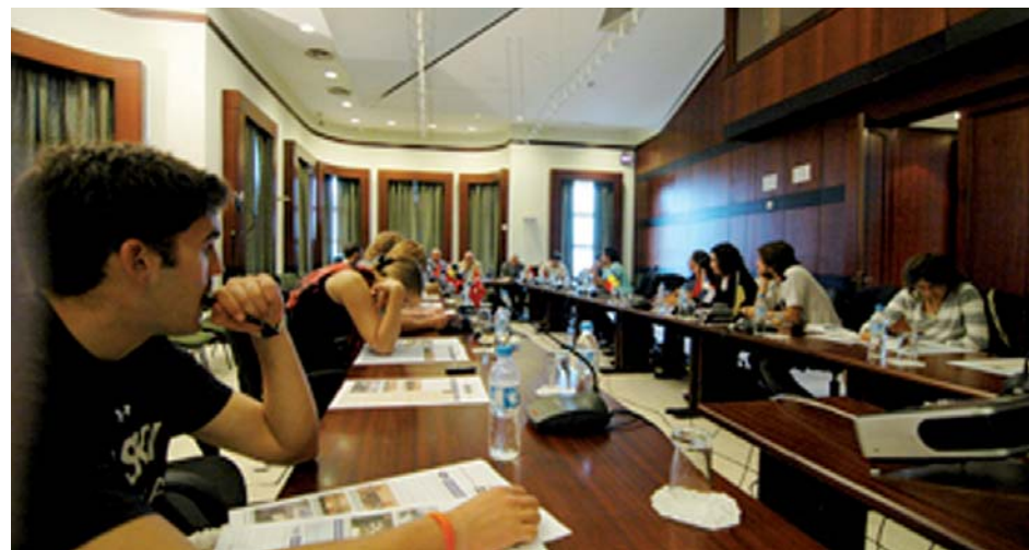
Students of the Montana State University Political Science Department at the BSEC headquarters in Istanbul.