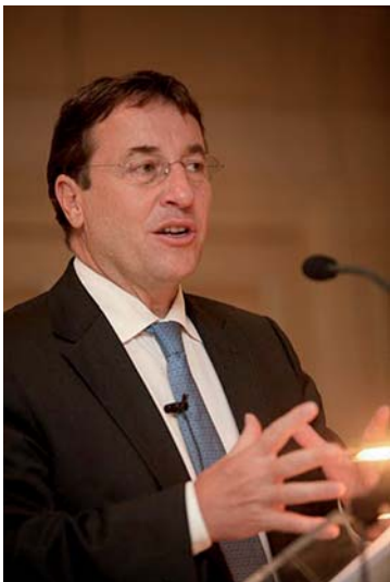
Mr. Achim STEINER, UN Under-Secretary General and Executive Director of the UN Environment Programme speaking at the Fifth ICBSS Annual Lecture.