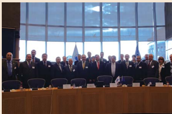
Participants of the 36th Meeting of the PABSEC Legal and Political Affairs Committee, held at the European Parliament premises in Brussels in October 2010.