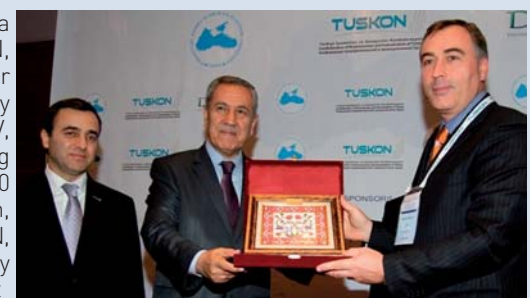
BSTDB sponsored the Black Sea Business Forum organized by the Turkish Business Confederation under the auspices of the BSEC Parliamentary Assembly in Trabzon.