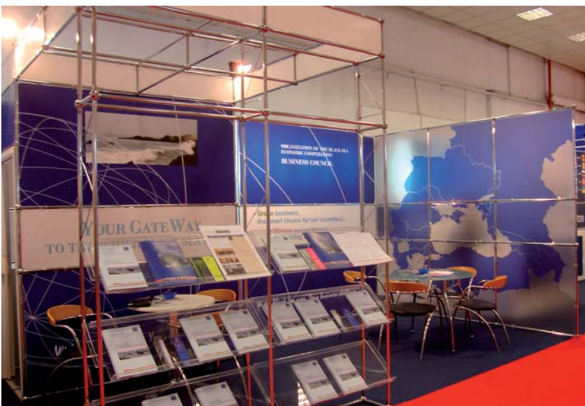
Joint BSEC BC-BSTDB stand at the 75th Thessaloniki International Fair.

The BSEC Business Council jointly participated with the Black Sea Trade and Development Bank (BSTDB) to the 75th Thessaloniki International Fair on 11-19 September 2010, setting up an information stand of a total area 48 m2 in the Thessaloniki International Exhibition Center. The opening ceremony of the joint stand took place with the participation of the members of the Greek Government, state officials, representatives of the Embassies and Consulates and the business community.