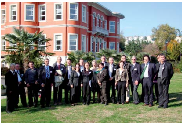
Group photo following the workshop entitled "Interactions on Scientific and Commercial Opportunities in the Field of Hydrogen Energy in the Black Sea Region" held at the BSEC headquarters in Istanbul, on 9-10 November 2010.

workshop entitled "Interactions on Scientific and Commercial Opportunities in the Field of Hydrogen Energy in the Black Sea Region." The event took place at the BSEC headquarters in Istanbul, on 9-10 November 2010.