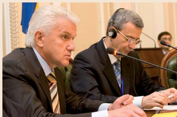
35th Meeting of the Economic, Commercial, Technological and Environmental Affairs Committee in Kyiv, on 29-30 September 2010.