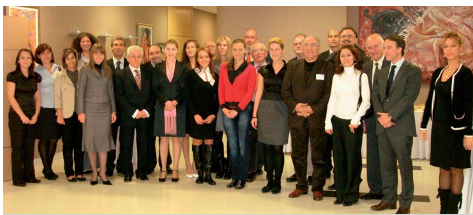
Participants of the joint BSEC-KAS Workshop on Entrepreneurial Education for SMEs, held on 13-15 October 2010, in Belgrade.