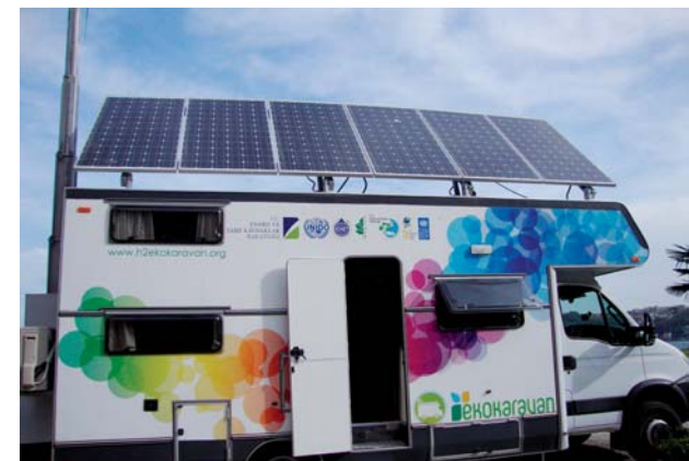
ECOCARAVAN presented by UNIDO-ICHET during the workshop on Hydrogen Energy.

presented the ECOCARAVAN, a vehicle developed by UNIDO-ICHET through the funding of GEF and the Ministry of Environment of the Republic of Turkey. The ECOCARAVAN is a platform to demonstrate the practical applications of renewable energy resources and hydrogen energy in Turkey.