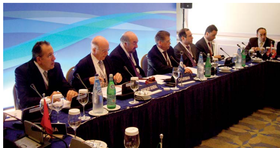
Meeting of the BSEC Ministers of Tourism in Athens, on 15 November 2010.

A Joint Declaration was adopted at the conclusion of the meeting. The Declaration is expected to serve as a guideline for the future activities of the BSEC Working Group on Cooperation in Tourism and to foster new joint initiatives and projects among the BSEC Member States. Also envisaged in the Declaration is the promotion of BSEC cultural tourism assets through future projects.