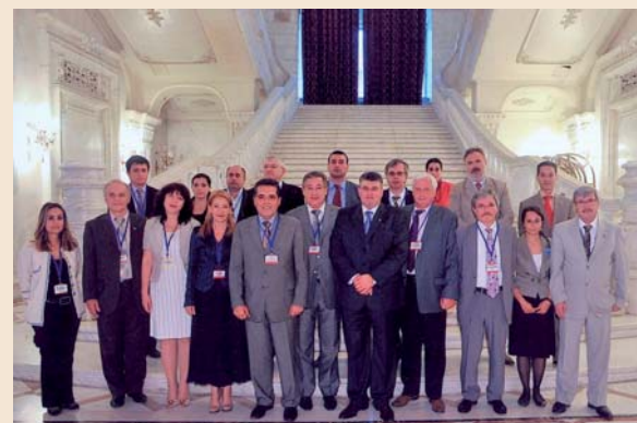
Participants of the 35th Meeting of the PABSEC Cultural, Educational and Social Affairs Committee, organized in Bucharest, on 15-16 September 2010.