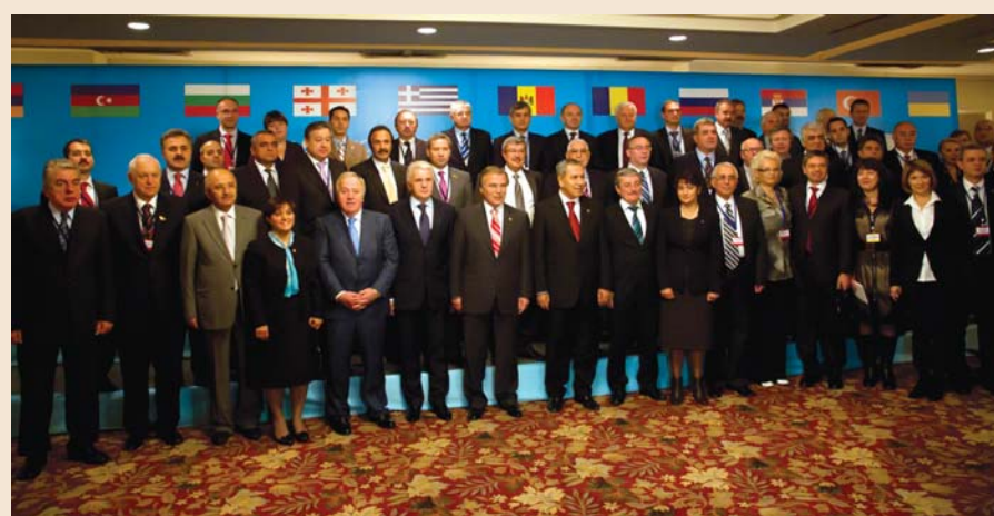
Family photo at the 36th Plenary Session of PABSEC General Assembly in Trabzon.

In accordance with the Rules of Procedure, following the end of the Thirty-Sixth Plenary Session, on 4 November 2010, Mr. Volodymyr LYTVYN, Chairman of the Verkhovna Rada of Ukraine, assumed the six-month term Presidency of PABSEC.